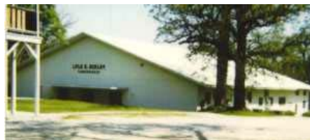
● Manville Camp Tabernacle

impression as you drive toward the main lodge area.