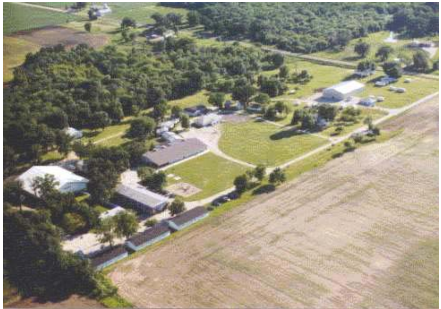
● Manville Camp – more information and pictures at www.manvillecamp.com

Possible off-site housing includes a Super-8 Motel and a Holiday Inn in Streator about 12 miles north of the